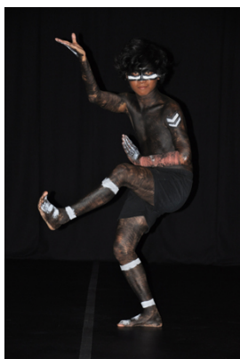
Animal Pop Family (dance group / from Indonesia)

Animal Pop is a dance style, created by Jecko Siompo, a Jakarta-based contemporary dancer-choreographer, and is a hybrid of Papua traditional dance and hip-hop. Recently, the dance style became very popular in Jakarta, Indonesia and dancers who perform this style are called the "Animal Pop Family".